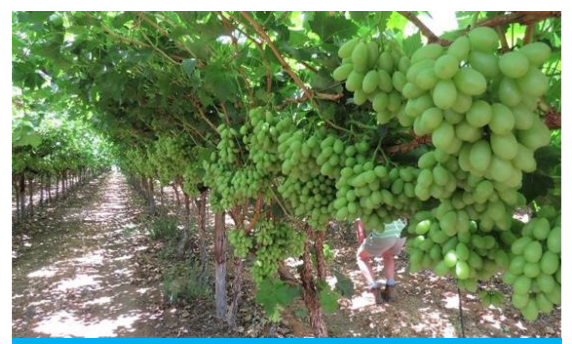
ARRA Sweeties™ (ARRA 15) had nice small bunches with an average of sixty berries per bunch, giving optimal consistency in the ripeness within each bunch and a yield large enough to satisfy any producer.