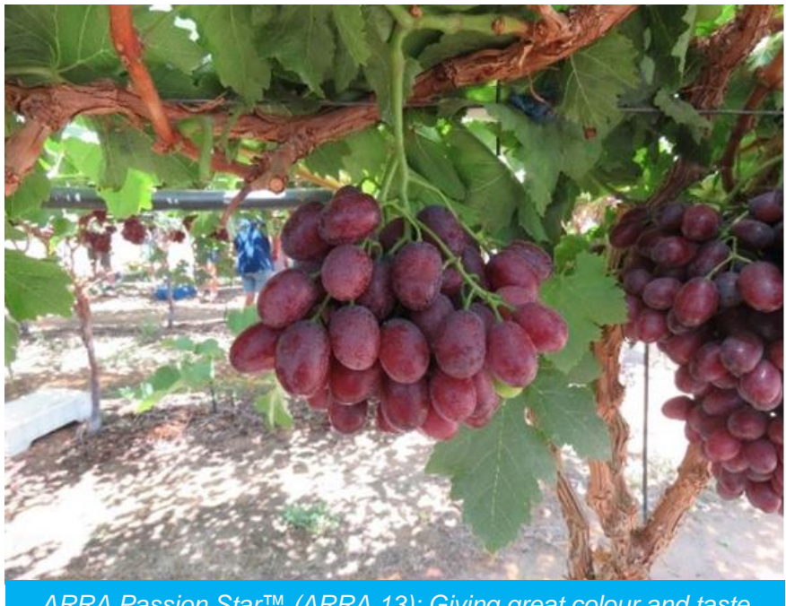
ARRA Passion Star™ (ARRA 13); Giving great colour and taste

Regarding the commercial vineyards; all praise must go to the team at Sweet Sensation for their preparation of the ARRA varieties, with attention to detail and following the growing protocol recommended by TopFruit, the great results were evident.