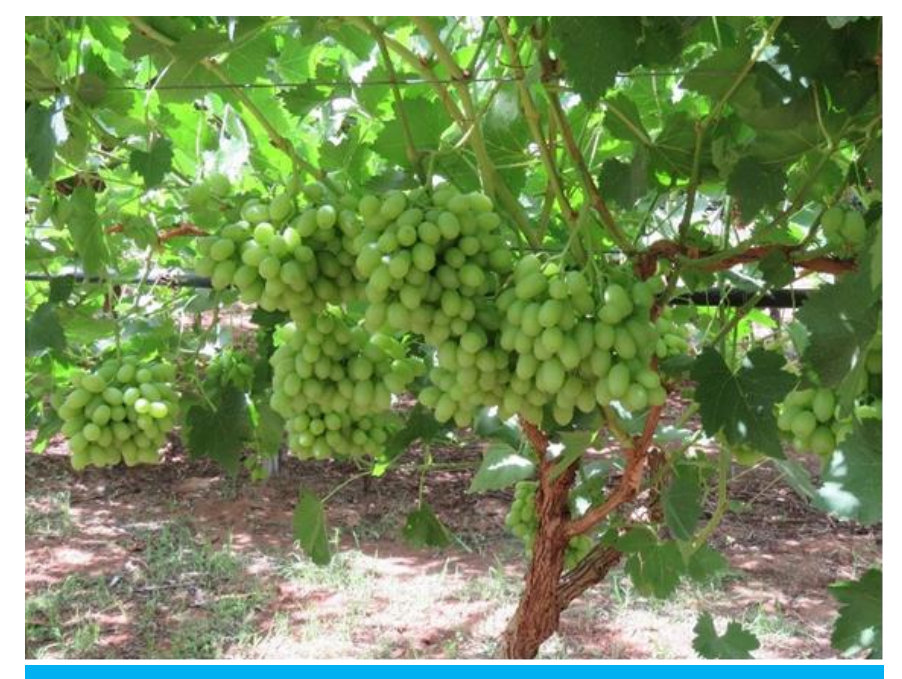
ARRA 8A-19+4 in the test block, showing its great potential

ARRA Passion Fire™ (ARRA 29) also received good feedback as an early red substitute commercially. ARRA Passion Fire (ARRA 29) vines have been planted extensively this year and the producers are very optimistic about this variety.