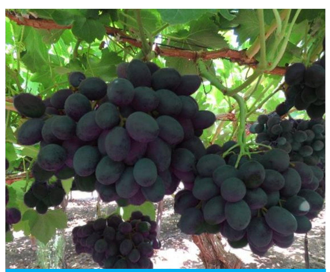
ARRA Mystic Bloom™ (ARRA 14) is grown on two different rootstocks and was a good talking point of the day, with discussion on the different manipulations that each had received, resulting in an amazing berry size.